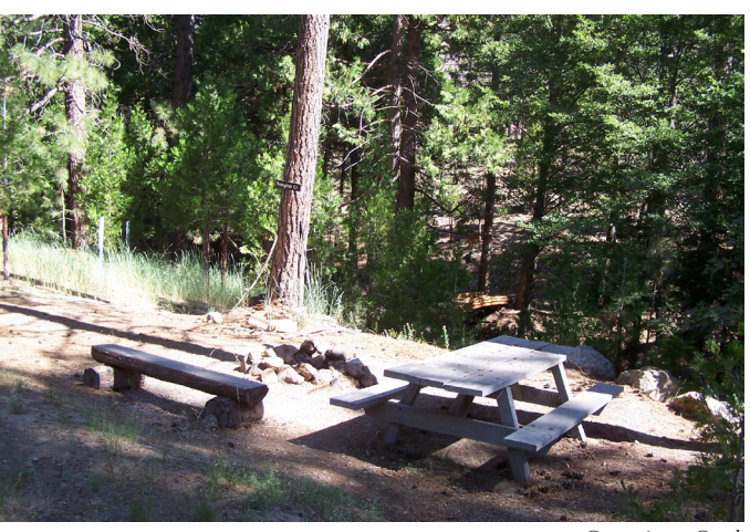
Campsite at Creek