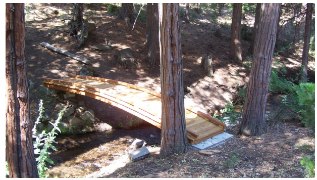
New Foot Bridge