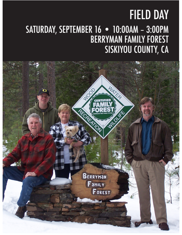
Entrance sign (winter)