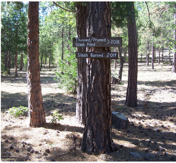
Signage Showing Forest Management