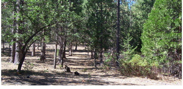
On the right side of photo is unthinned (wild) forest. On the left side is thinned, brushed and piles are burned.